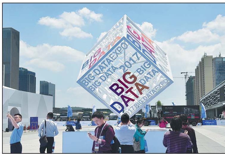
The China International Big Data Industry Expo 2017 in Guiyang attracted more than 310 enterprises and institutions.

massive data for its advanced automated vehicles. It will also use the information for research and development.