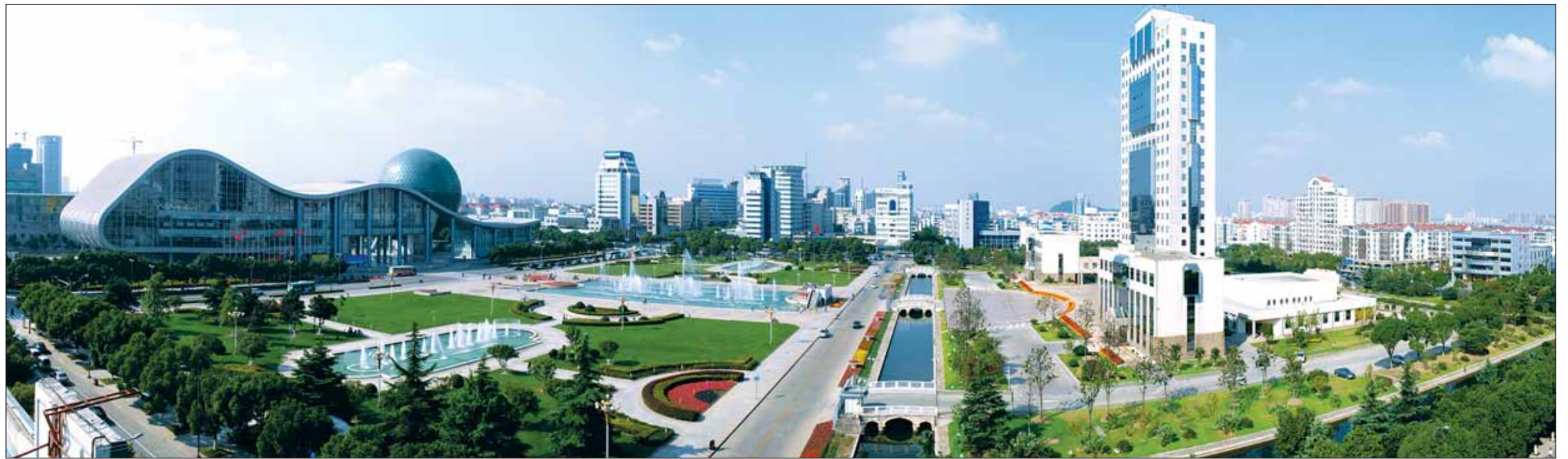
An aerial view of Kunshan, East China's Jiangsu province