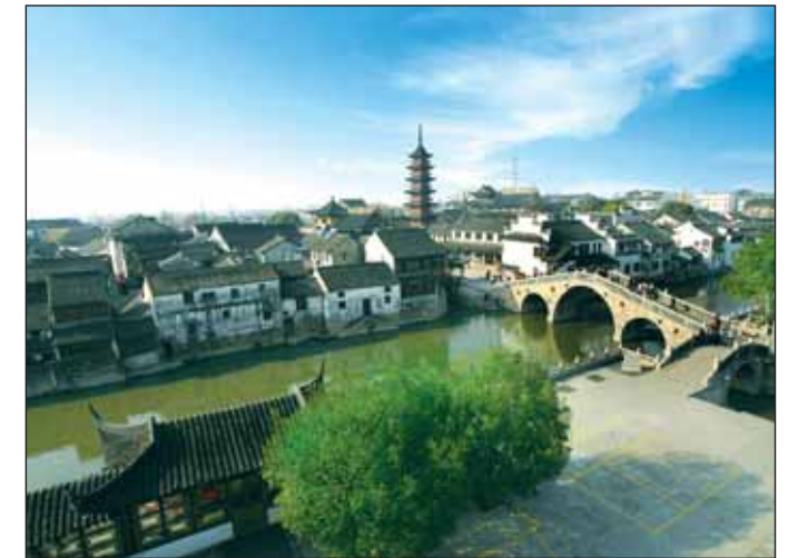
Qiangdeng, an ancient water town in Kunshan, Jiangsu province